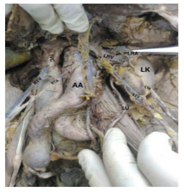
Fig.1 showing origin of testicular arteries of both side

left testicular artery originated from the left renal artery. The testicular artery of other side originated from its normal position i.e. from the lateral branch of abdominal aorta just below the origin of right renal artery. Both sided renal vein were normal in draining i.e. left sided testicular vein drains into left renal vein and right sided testicular vein in inferior vena cava. On both side, there was no additional branch from abdominal aorta to the testes and also absence of any additional renal artery.