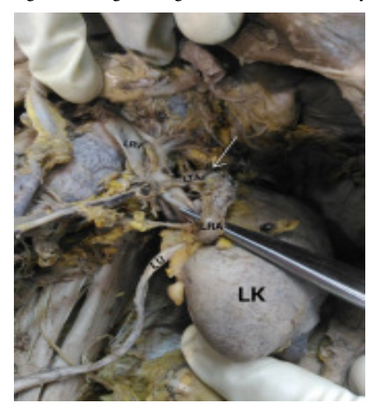
Fig.3 showing the origin of left testicular artery (marked by arrow) fro left renal artery.